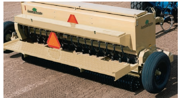
The optional walkboard allows for safe and spacious access to the seedboxes.