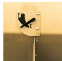
Seed level indicator is in full view from the tractor seat.