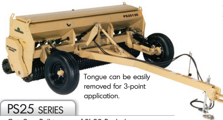
Tongue can be easily removed for 3-point application.

Primary seedbox is balanced between the front and rear rollers, eliminating bulldozing in light soils. The optional 4 bushel small seeds box will allow a 10%-20% rate of second seed with both boxes emptying at the same time.