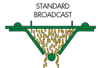
Adjustable seed openings to handle fluffy or small seeds.