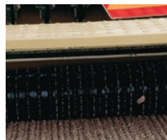
The rear packers split the rows made by the front packers, increasing the number of notches that push air bubbles out and seed in.