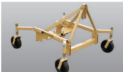
Steel chassis — The all welded steel chassis forms a single integrated unit designed to support the mowing deck and to absorb shock loads incurred by the wheels and the front of the deck.