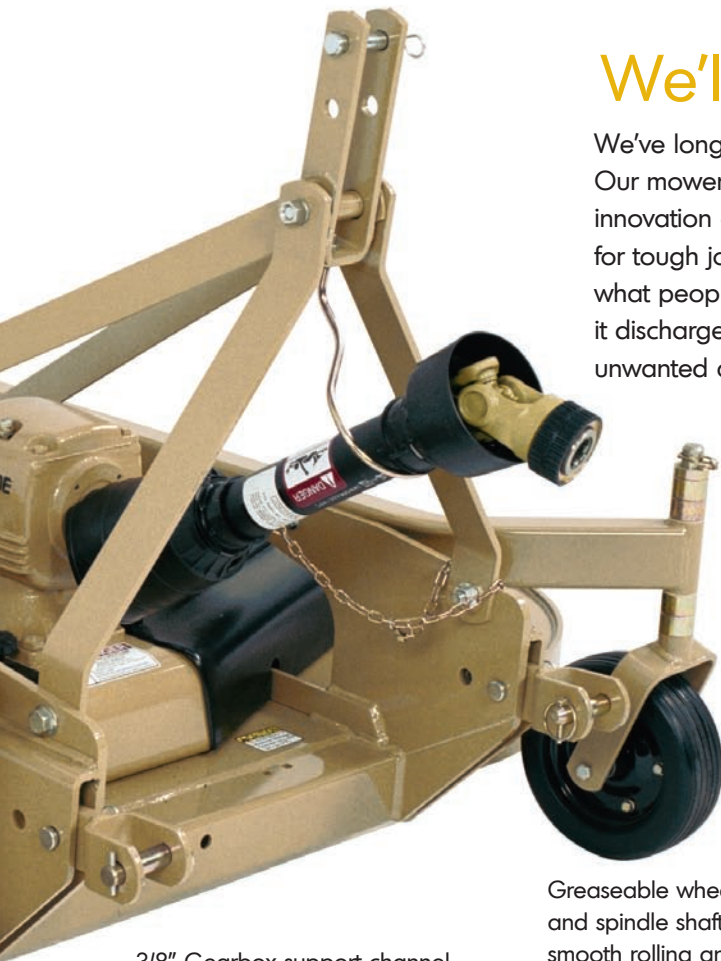
3/8" Gearbox support channel handles high stress loads.