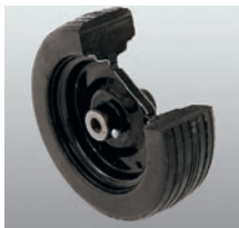
Solid rubber tires on 72" model are sandwiched between the rim halves and bolted in.