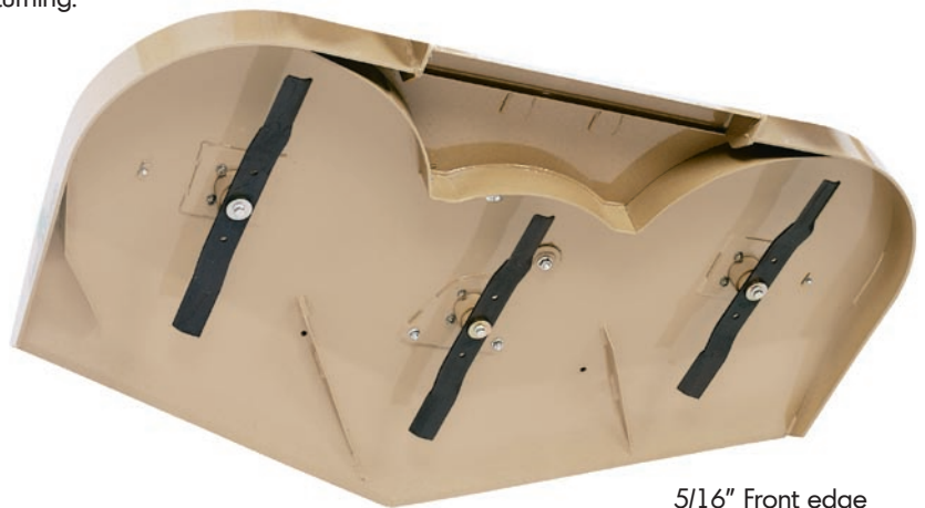
5/16" Front edge support protects deck

Land Pride's unique baffling system performs with results to make professionals smile. Strategically located to maximize air flow for clean distribution, yet minimize grass obstruction, our underside deck design is simple, yet very effective.