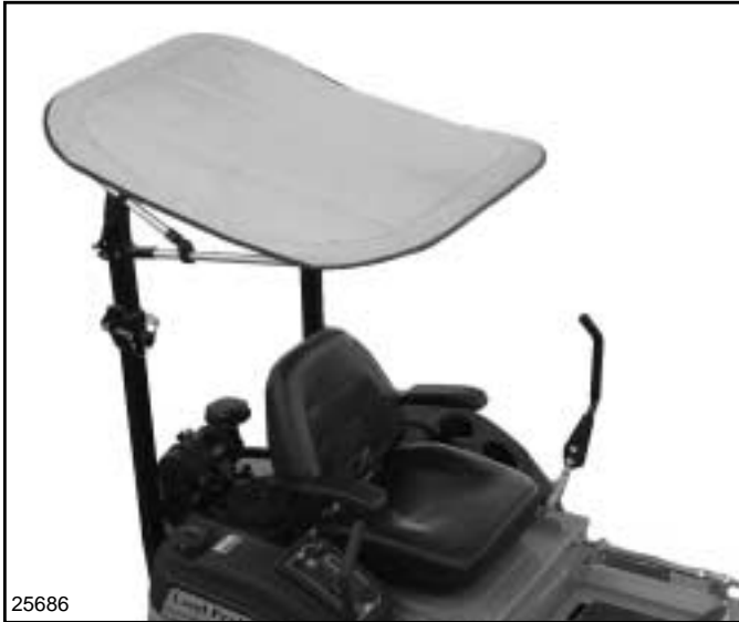
Folding Soft Top Canopy (ZT Mower Shown) Figure 1

ZXT54, ZXT60, ZT60, ZT72, ZT60i & ZT72i (Zero Turn W/ ROPS) Manual No. 357-235M