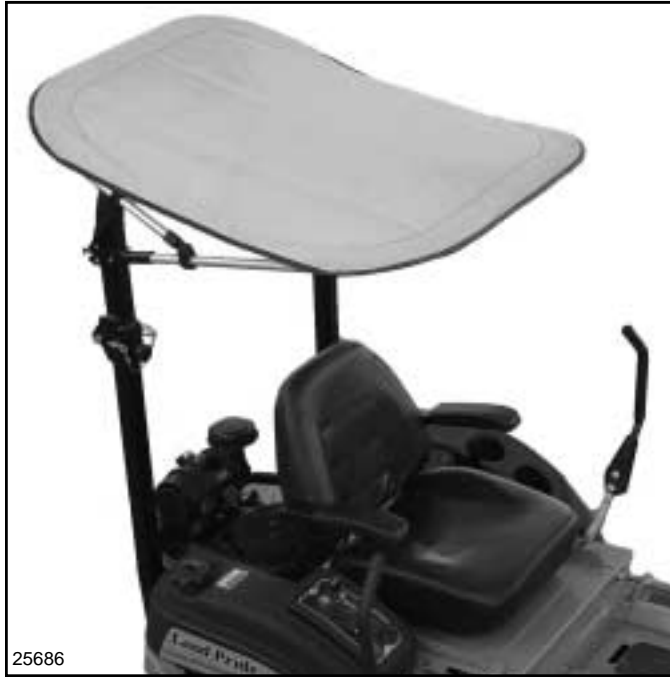
Folding Soft Top Canopy Figure 1